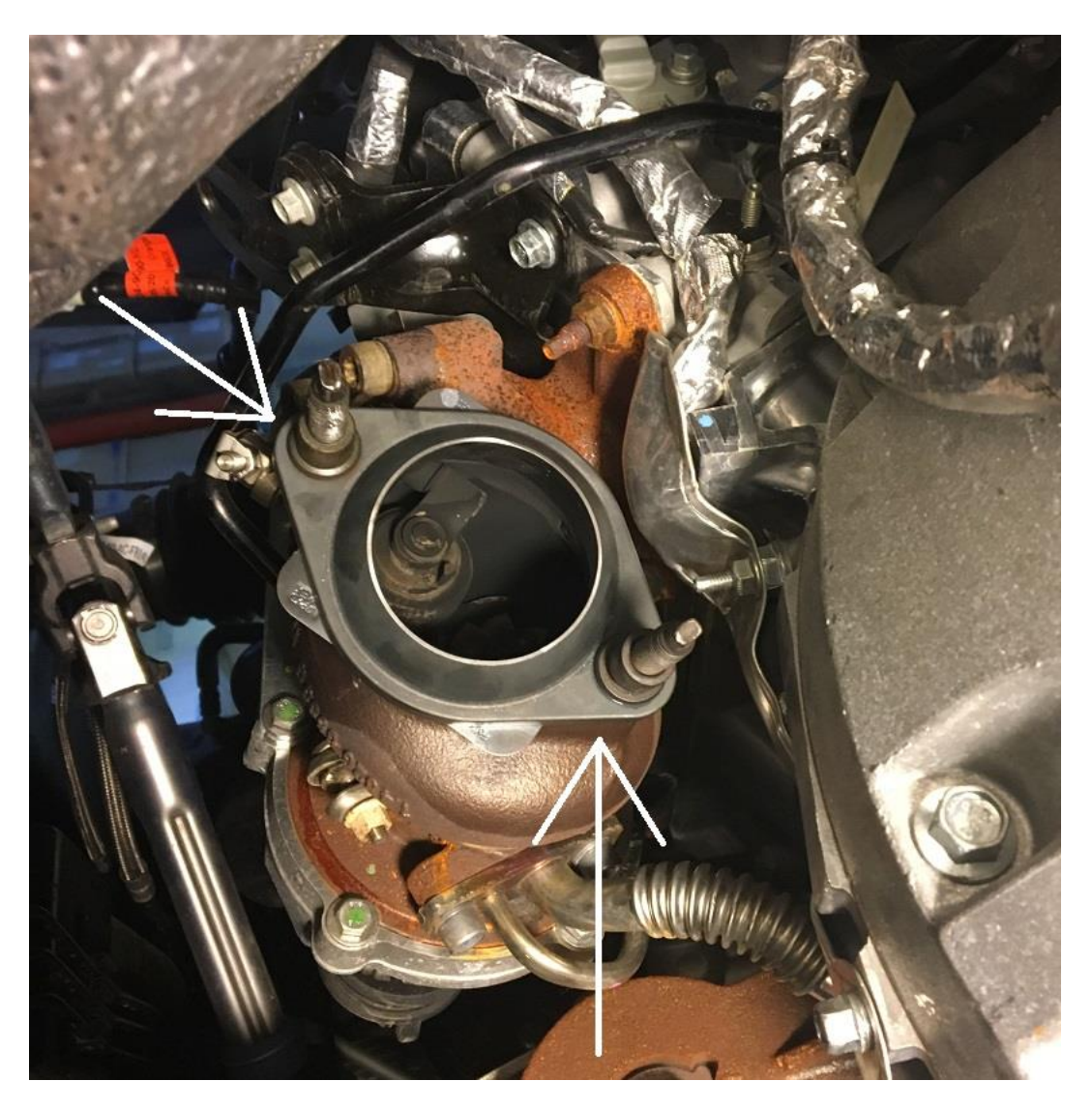
Step 5: If you're using the included stud socket, heat the turbo housing where the arrows are pointing to until red hot and then remove the studs. If you're using a heavy duty stud extractor like a Mac SR-10A socket, then not much heat is needed here. (Note: This image already shows our turbo adapter installed)