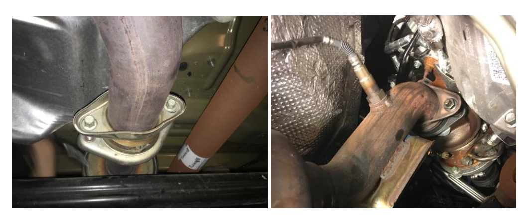
Step 3: Remove the two bolts that connect the downpipe to the resonator pipe. Step 4: Remove the two nuts that attach the downpipe to the turbo. You must do this for both sides. Push the downpipe back and lower until you can access the adapter studs.